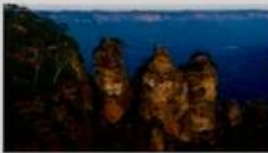
The Three Sister

Today we escape to the world famous Blue Mountains and take a journey through time to re-discover the elegance that is The Hydro Majestic. The iconic Hydro Majestic is situated along the escarpment edge of the spectacular World Heritage-listed Blue Mountains overlooking the picturesque Megalong Valley. We take a tour of this property in all its grandeur then make our way to another historic hotel of the Blue Mountains...The Carrington Hotel. Built in 1882 The Carrington is a unique Heritage Property in the heart of Katoomba in the Blue Mountains. It is steeped in history and the elegance of a bygone era. Here we enjoy a beautiful 2 course luncheon in a magnificent setting. Before we depart the Blue Mountains we make our way to Echo Point, a great vantage point for views of the Three Sisters. Some walking involved. Suitable for most abilities.