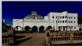
The Hydro Majestic