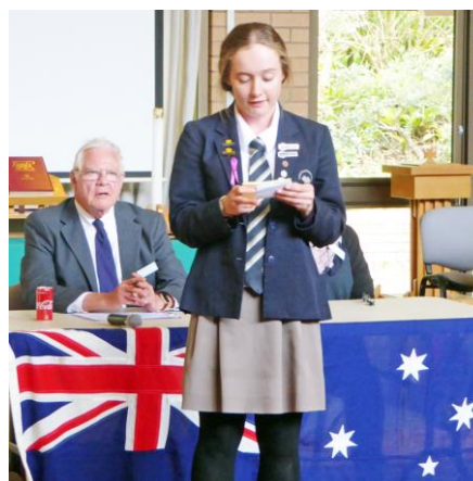
One of the 2017 debaters from Central Coast Grammar School.